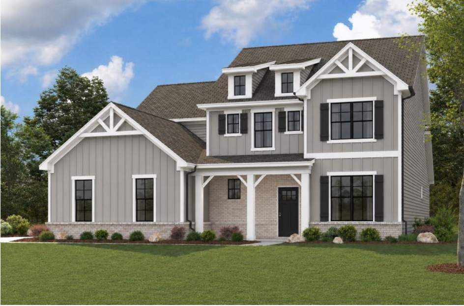
H2 Elevation Color Package 6

3,829 square feet | 6 BR | 5.5 Baths | 2 Bay