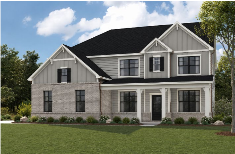
G2 Elevation Color Package 15