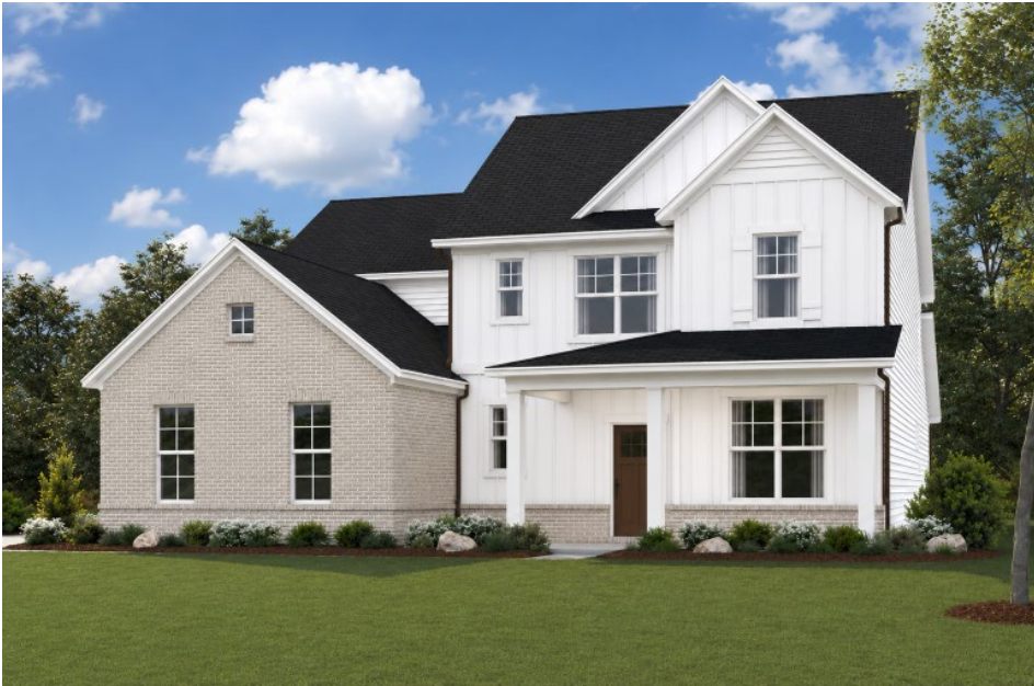
I2 Elevation Color Package 15