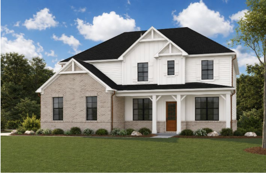
F2 Elevation Color Package 6

3,404 square feet | 5 BR | 4 Baths | 2 Bay